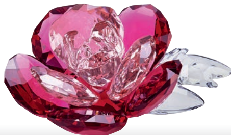
»PEONY« This flower represents wellbeing, security, and motherly love