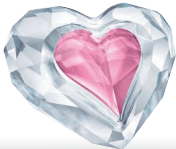
»HEART – ONLY FOR YOU« Engraved on the inside of the crystal heart is the message »Only for You«